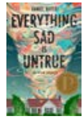
November 14 Everything Sad is Untrue by Daniel Nayeri