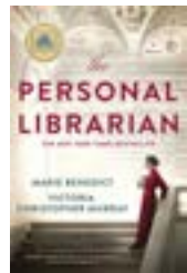
September 12 The Personal Librarian by Marie Benedict

This group meets on the second Tuesday of each month at 7:30pm at the library. Volunteers from among the group lead the discussion, with background materials supplied by the librarian. Each month the current title is available at the help desk on the main level. New members are always welcome! For more information, e-mail info@plymouthlibrary.org .