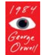
October 25 Nineteen Eighty-Four by George Orwell