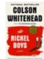
September 27 The Nickel Boys by Colson Whitehead