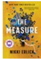
September 20 The Measure by Nikki Erlick

This book club meets monthly at 7pm to talk books, socialize, and kick back with a beverage. Meetings take place at Arbor Brewing Plymouth Taproom. Books for the current month's selection may be obtained from the reader's advisory desk on the main level of the Library. New members are always welcome!