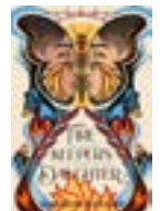
November 22 Firekeeper's Daughter by Angeline Boulley