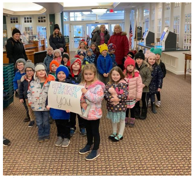
Kids from Our Lady of Good Counsel toured the library during a school visit. In April, 72 students participated in outreach activities with the library.