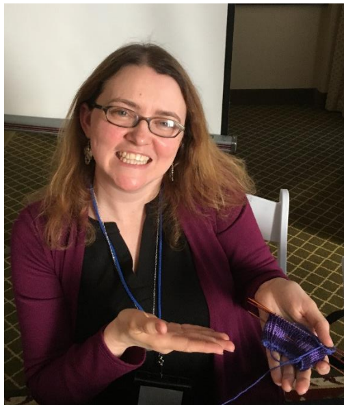
6 Tui Sutherland